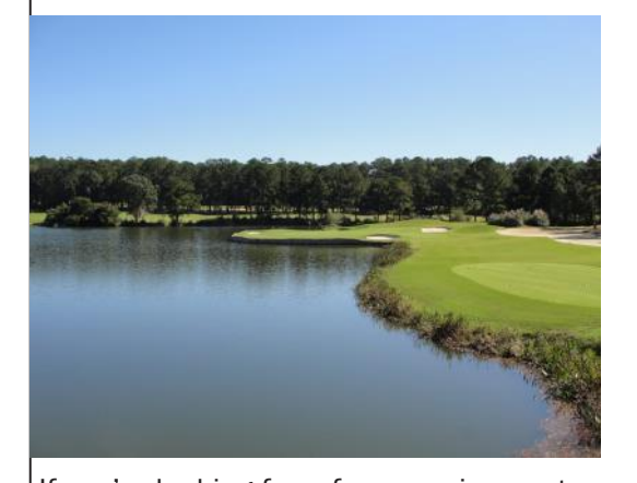
Checkout the 30 best GOLF COURSE HOMES in Tallahassee that you could literally buy today!

For the more serious golfer, <u>Golden Eagle Country Club</u> is perfect. Designed by the world renowned golf course architect, Tom Fazio, Golden Eagle is sure to challenge even the most skilled of players.