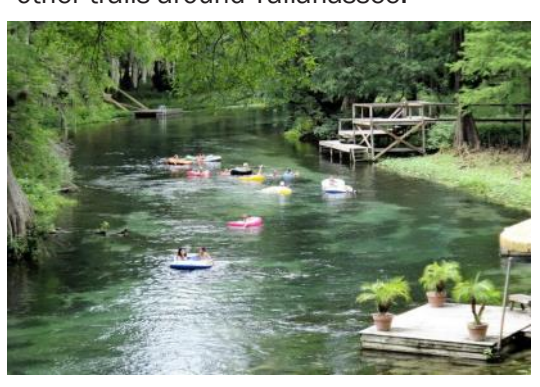
But a summer vacation isn't complete without some unique activities

Once you are on the river you will be amazed at how a wilderness experience like this can be so close to civilization. Check out the <u>Trailahassee website</u> for more information about this river and other trails around Tallahassee.